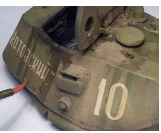
On horizontal areas where dust is accumulated, the product is applied especially around raised details and protrusions.