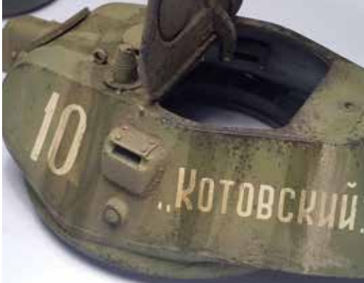
6 Depending on personal taste more or less product can be added to the model, until the final appearance is satisfactory.