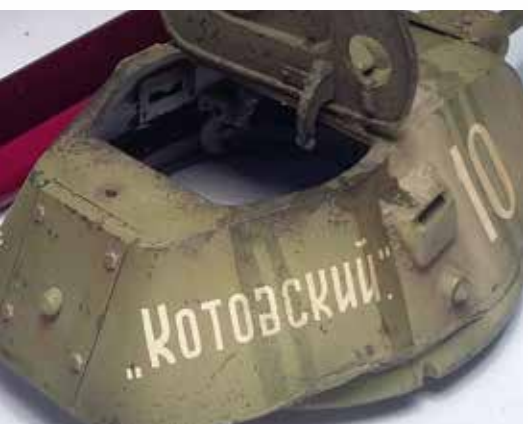
5 Now we blend the traces and painted areas using a flat brush moistened with Thinner, it's important for the base colors dry completely, best wait 24 hours before applying the weathering effect with the Thinner.