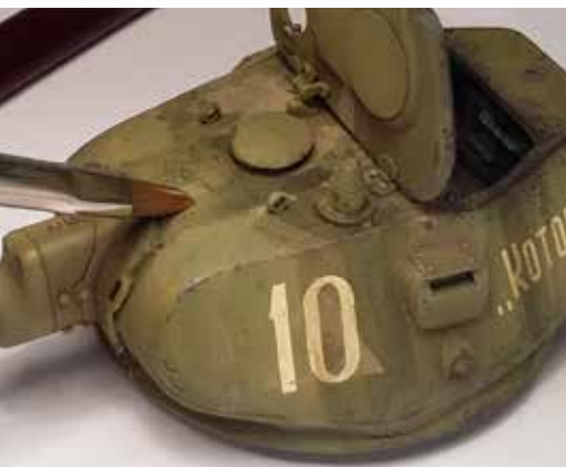
3 In some places we can use a flat brush for a wider trace. It is important to keep in mind the effect of gravity and the direction of the traces.