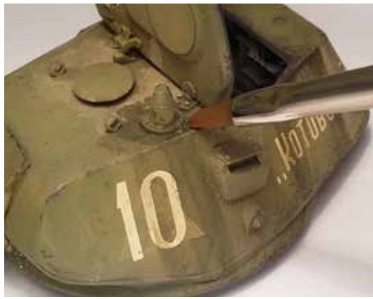
On the vertical surfaces we draw traces with a round-tip brush, not all of them with the same thickness, and avoiding too symmetrical a pattern.