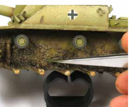
Original photo references are used to obtain a realistic result. Here we are showing the product on the lower side of the vehicle, combined with Thick Mud (see Weathering Effects). Once the mixture has dried, it will not change color.